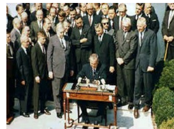
President Lyndon Johnson signing the Economic Opportunity Act of 1964 into law.

Community Action Agencies such as DCCS are charged with the task of helping low-income families achieve and maintain a higher level of self sufficiency. To do this, CAA's offer a variety of programs including, family self-sufficiency, emergency services, education, food and nutrition, training/employment, and so on. A key funding component of CAA's is the Community Services Block Grant which was established in 1981.