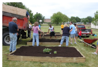
Volunteers preparing the gardens at Lewis Street Apartments in DeKalb.

At our core is a group of concerned citizens, educators, parents, farmers, community activists, and master gardeners who have come together, bringing with them a wealth of