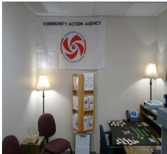
Client resource area at DCCS.

DCCSD offers a warm and welcoming area for members of the community to come in and utilize two computers, phones, and printer/copier to assist them in their job search. Internet access is available to check job listings, complete applications, and/or to contact employers. There are programs available to help with building resumes and interviewing skills.