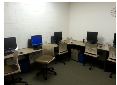
One side of the computer lab. The preparer and customer sit here to complete taxes.