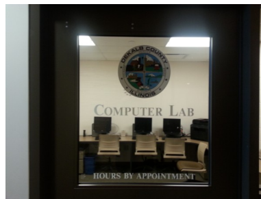
The door to the computer lab where tax preparation takes place.